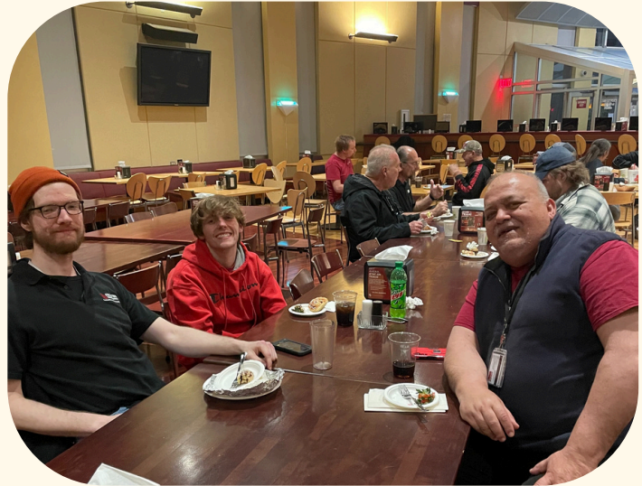
Pictured Above: team members from the overnight Custodial Athletics team

On Tuesday, March 18, the department held the Spring Appreciation Breakfast—an annual event where we celebrate and express appreciation to Facilities Management team members for their hard work and dedication to the department. The menu featured delicious breakfast burritos and sandwiches, home fries, fresh fruit, and pastries. A special thank you to OU Food Services for accommodating our event and starting their day early just for us!