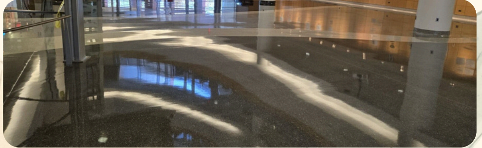
Pictured Above: Custodial Services scrubbed and waxed the atrium at the National Water Center.