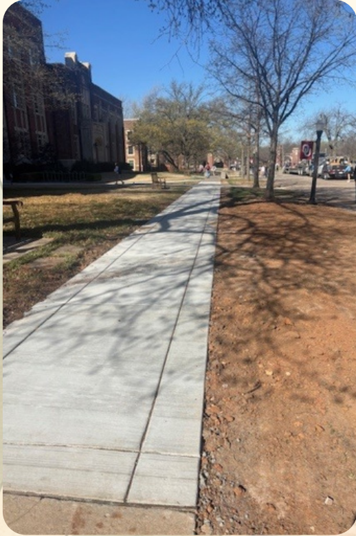
Pictured Above: Several sidewalks, including this one by Nielsen, were redone by Maintenance Services.

Several projects across all divisions with Facilities Management took place over Spring Break.