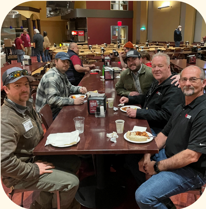
Pictured Above: team members of the Access Control Shop