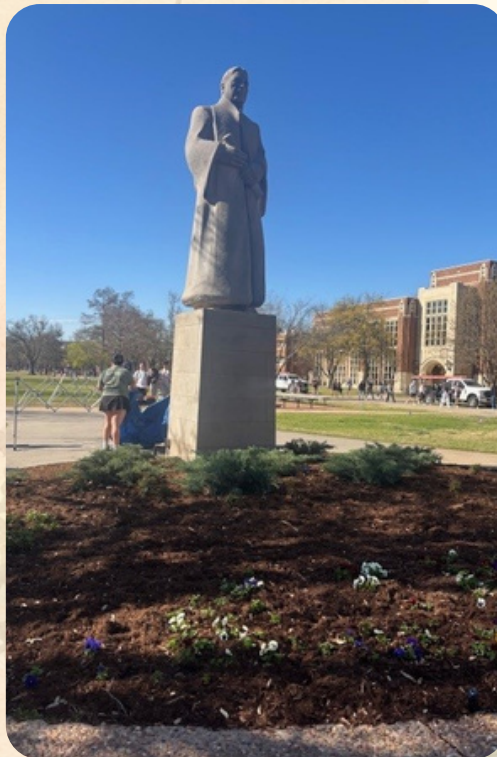
Pictured Above: Landscape Services prepped beds on the South Oval for new spring flowers.